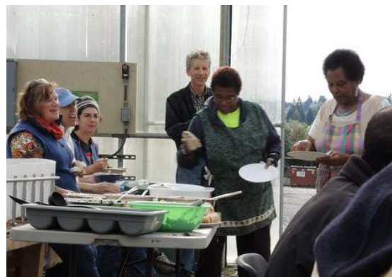
A special community lunch enjoyed by all