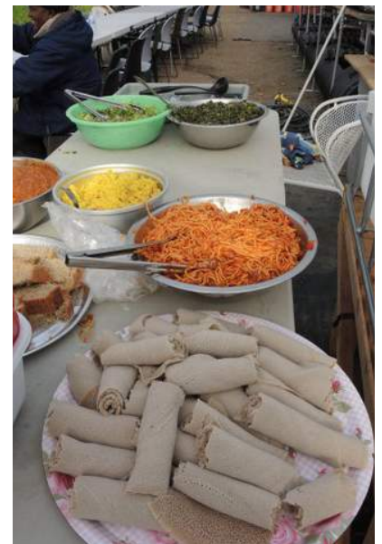
Wonderful African food